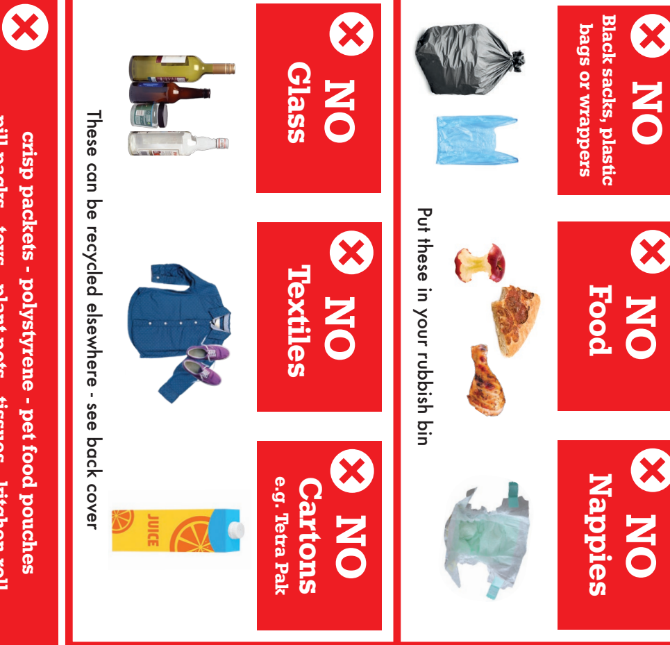
wipes - shredded paper - wood - hazardous waste pill packs - toys - plant pots - tissues - kitchen roll crisp packets - polystyrene - pet food pouches